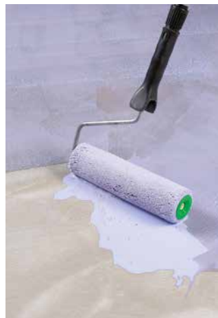
1. Special adhesive primer DX 9 must be applied evenly to absorbent and non-absorbent surfaces.