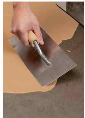
2. If possible, Rapid Filling Compound SL 52 should be applied to the primed surface in a single application until the desired layer thickness is achieved.