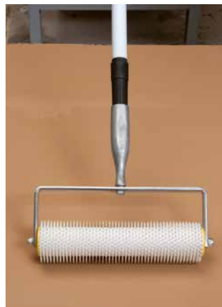
3. To ensure optimal flow, the Rapid Filling Compound SL 52 can be vented using a spiked roller.