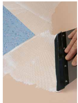
4. Elastic and textile floor coverings can be bonded with the design covering adhesive D 495 or with the floor covering adhesive Quattro Floor D 444 , or the special design floor covering adhesive X-Bond MS-K 499 .